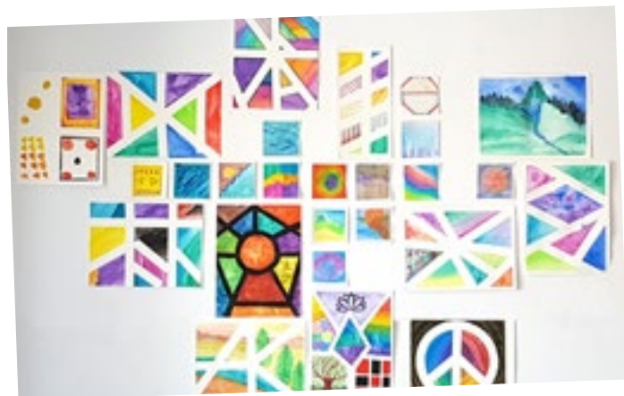
Participant art from the Healing Through Artistic Expression project